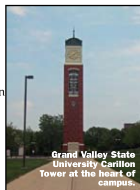
Grand Valley State University Carillon Tower at the heart of campus.