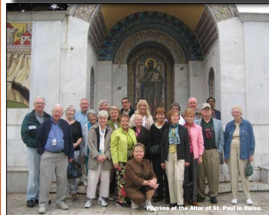
Pilgrims at the Altar of St. Paul in Berea.