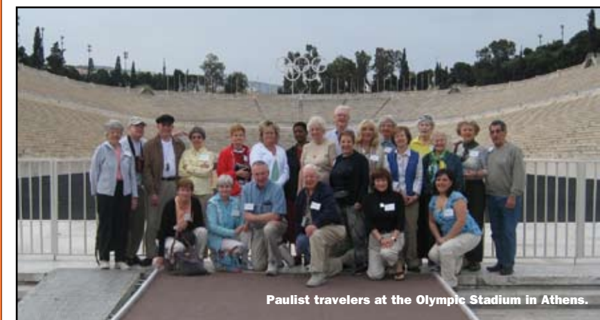
Paulist travelers at the Olympic Stadium in Athens.