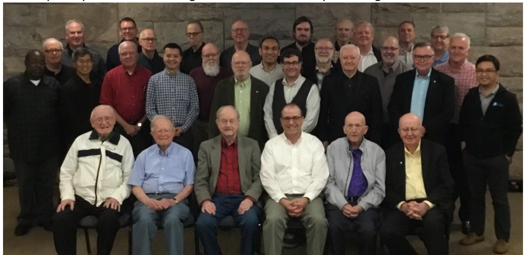
Figure 3: Paulist Fathers at the General Assembly

The 2018 General Assembly was definitely a gathering of collegial unity and hopeful anticipation of the Holy Spirit's guidance. While the community faces on-going challenges in finances and our aging demographics, there was a palpable sense that the Paulist Mission is needed today more than any time in our past. The Assembly delegates responded to the Spirit's guidance with careful deliberation and a commitment to our Mission.