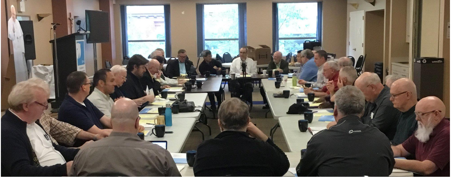
Figure 2: Paulist Fathers discussing a variety of topics

The Paulist Fathers aren't known for an excess of external structures, rules, and policies. Still, like any religious congregation in the Catholic Church, we are governed by the Church's Code of Canon Law, and our own Constitution (our “particular law”, in canonical parlance). Within these documents are defined the three primary governance structures of the community: