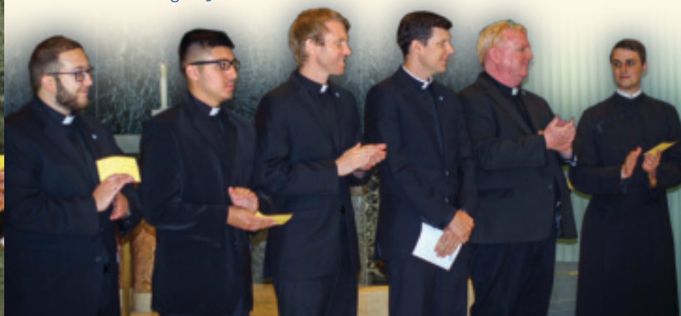
BELOW: During the Promises Mass on August 31.