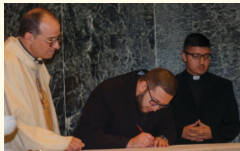
BELOW: During the Promises Mass on August 31.