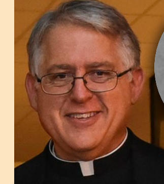
LEARN MORE: paulist.org/FrGreg