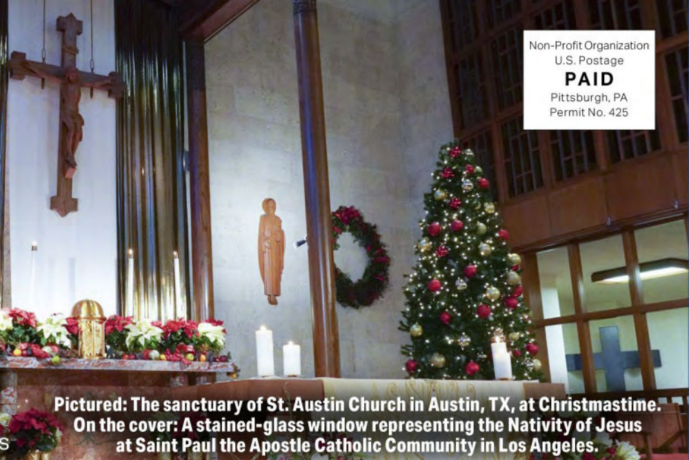
Pictured: The sanctuary of St. Austin Church in Austin, TX, at Christmastime. On the cover: A stained-glass window representing the Nativity of Jesus at Saint Paul the Apostle Catholic Community in Los Angeles.

Non-Profit Organization U.S. Postage PAID Pittsburgh, PA Permit No. 425