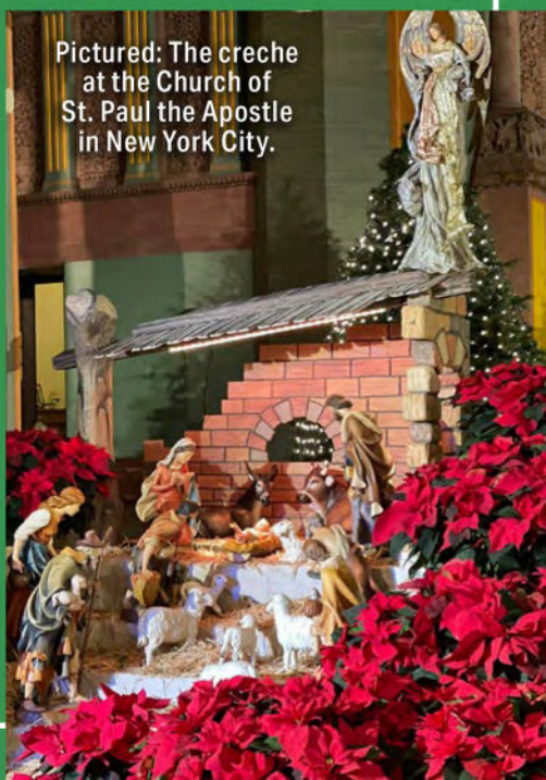
Pictured: The creche at the Church of St. Paul the Apostle in New York City.

P.S. We know that some of our parishioners, friends, and benefactors prefer to make financial contributions in the final days of the calendar year for tax purposes. To support our mission and ministries with a year-end gift, please use the enclosed envelope or visit: paulist.org/apa . Thank you for your generosity!